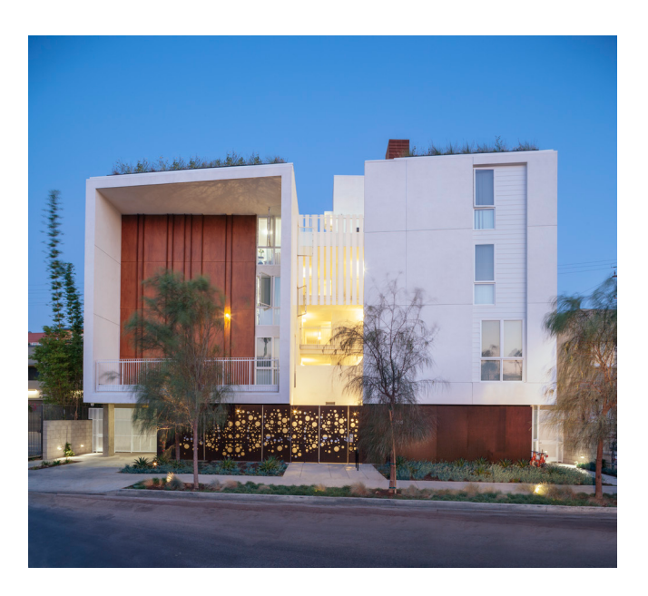
Figure 1. Gateway Apartments, 13368 Beach Ave, Venice, Ca. 21 one-bedroom apartment units. 100% affordable housing for homeless adults. 111 units/acre. LEED Platinum. Architect: Brooks + Scarpa Developer: Venice Community Housing Corporation. Utilized the local density bonus ordinance (# 179681) and the State of California's low-income housing tax credit program.

Unfortunately, even with all of this good policy, two glaring impediments still exist: an overall lack of affordable housing and a political structure that favors the singular over the needs of the many. The lack of supply is a direct result of the lack of comprehensive zoning reform throughout the city and the county. The political structure, a city of 'silos', consists