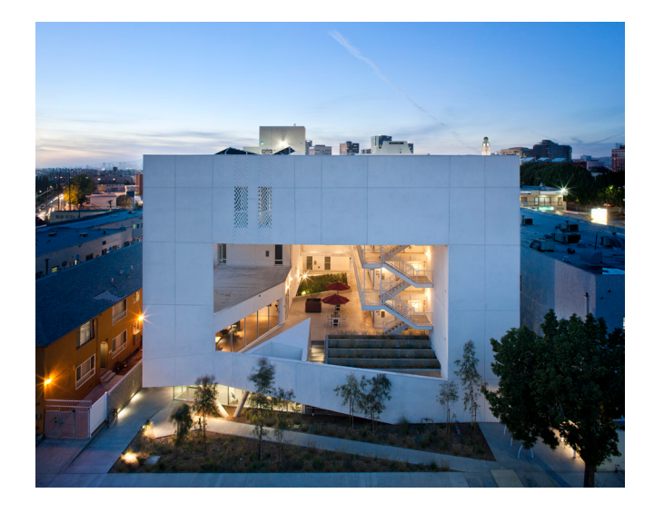
Figure 4. The Six, 811 S Carondelet Street, Los Angeles, Ca. 52 studio and one-bedroom apartments. 100% affordable housing for homeless adults and homeless veterans. 153 units/acre. LEED Platinum. Architect: Brooks + Scarpa Developer: Skid Row Housing Trust. Utilized the local density bonus ordinance (# 179681) and the State of California's low-income housing tax credit program.

The modular kit of parts is scalable and adaptable within different housing types: 'Blue Jay' is for temporary housing, 'Dove' is for small-scale permanent and shared space housing and 'Osprey' is for permanent larger family units, all can be combined for different size sites and different neighborhoods. It is a long-term solution meant to bring housing for the homeless to market quicker (reducing costs) and transform the way communities can provide housing for the homeless through dignity, density and design. Potential plug-ins for energy and water are being investigated.