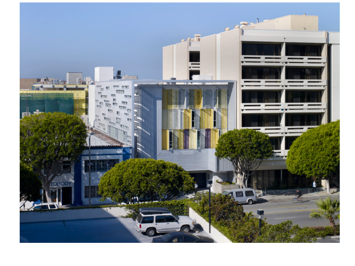
Figure 2. Step Up on Fifth, 1548 Fifth Street, Santa Monica, Ca. 46 micro-apartments. 100% affordable housing for homeless adults with mental and physical disabilities. 245 units/acre. 2011 AIA Top Ten Green award. Architect: Brooks + Scarpa Developer: Step Up on Second and A Community of Friends. Utilized the local parking code for reduced parking and the State of California's low-income housing tax credit program. Built below the height limit to lessen the impacts of discretionary review.

The homeless population in Los Angeles increased by 12% last year. This is an urgent local crisis, and a 2005 statemandated density bonus law (SB1818, providing incentives such as increased density and reduced parking) has not proven effective enough. More and varied policy is needed,